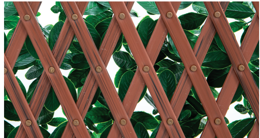
MATERIAL CLOSE UP - BACK - TRUETECH® PVC FRAME