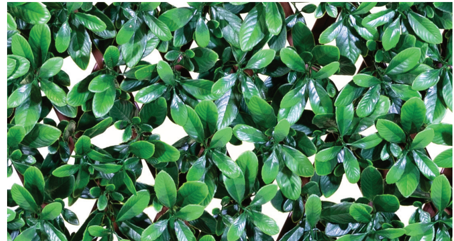
MATERIAL CLOSE UP - FRONT - LDPE REAL LEAF® 3D FOLIAGE