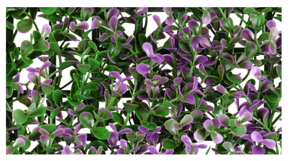
FRONT - REALLEAF® MAT CLOSEUP