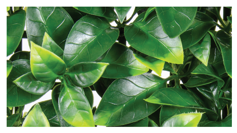
FRONT - REALLEAF® MAT CLOSEUP