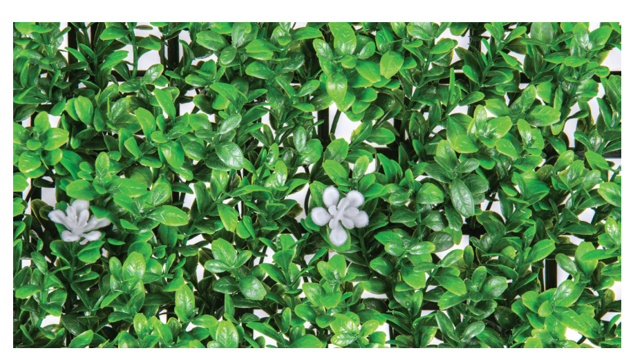
FRONT - REALLEAF® MAT CLOSEUP