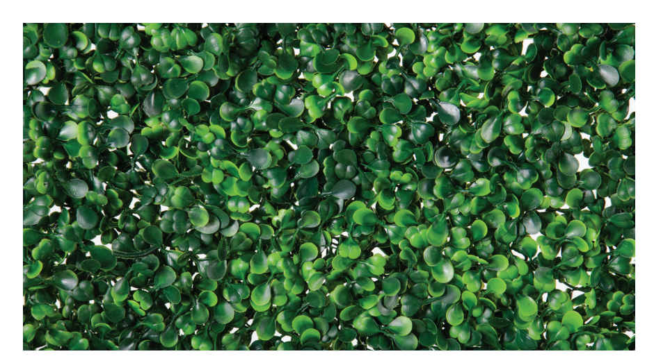
FRONT - REALLEAF® ROLL CLOSEUP